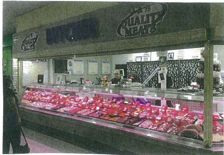
Our New Membership Sponsor J & S Quality Meats February