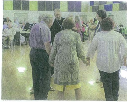
Vision Impaired having a great time